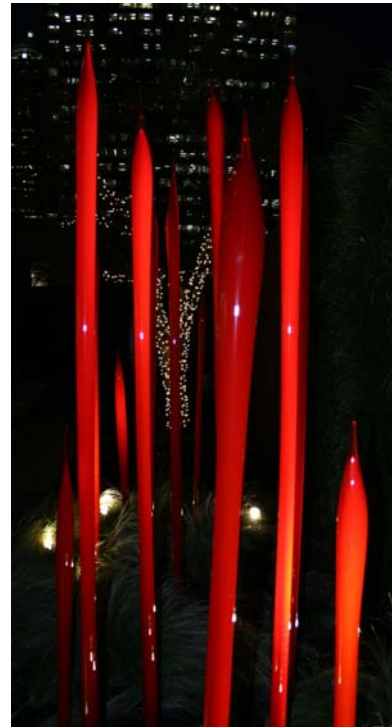
Dale Chihuly sculpture at Methodologie.